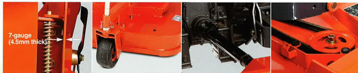
Fabricated deck with 7-gauge steel construction

A durable, hard-working deck that's ready for a wide range of mowing jobs.