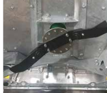
Two in one blade system, rigid and swinging